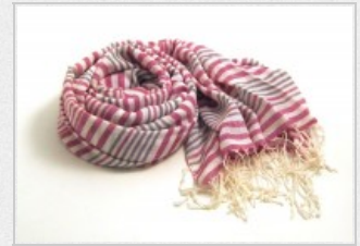
Striped Pink and Grey Scarf