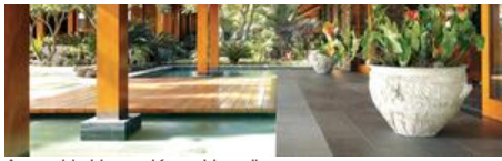
Assembly House, Kona, Hawaii