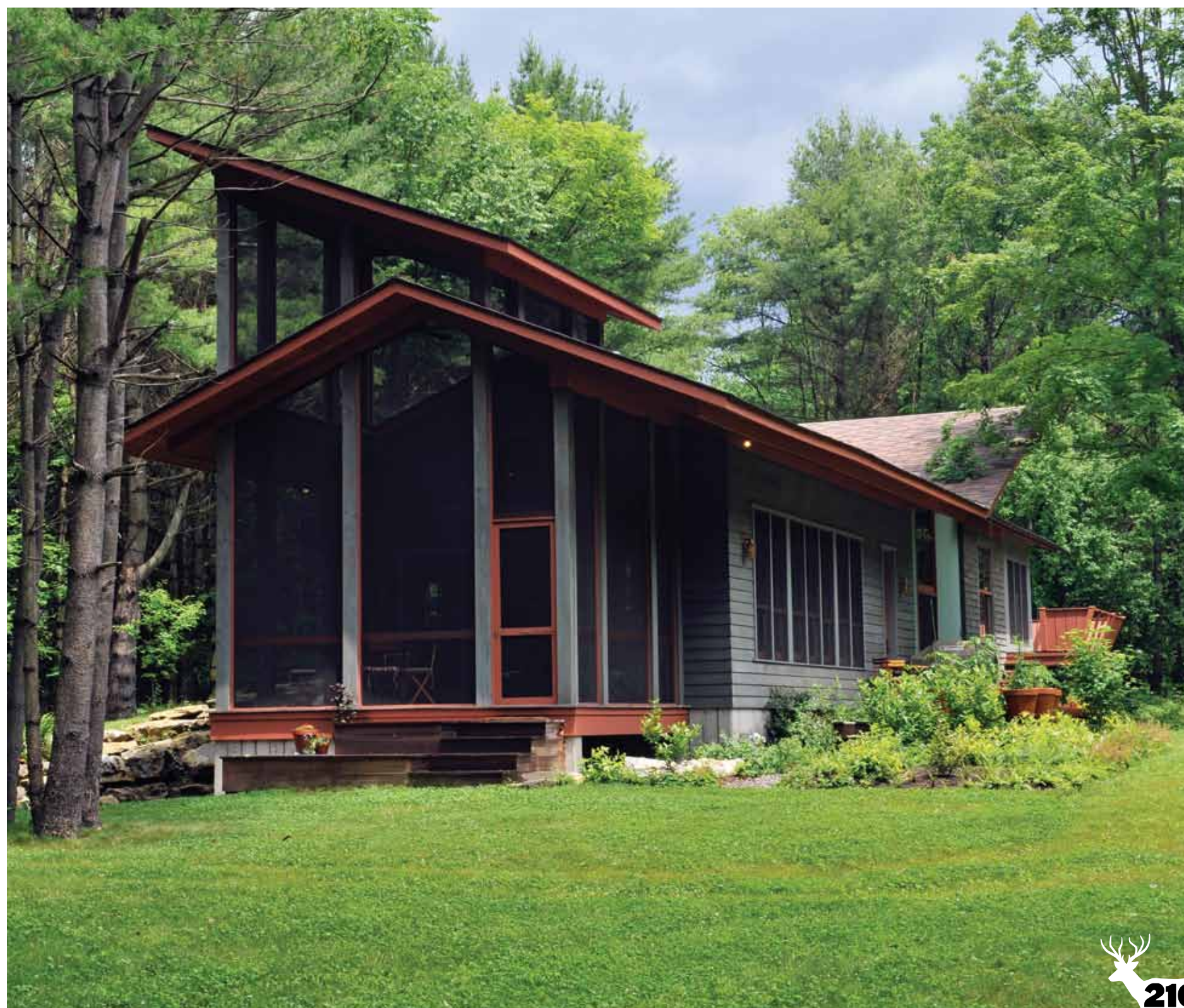
PROJECT | Hillsdale Residence, 3 Bed 2 Bath Woodland Cottage

At just 2,100 square feet, Ron's house uses its square footage diligently, committing the bulk of it to one big room used for nearly all household activities from dinner parties to laundry-folding. Bedrooms are modest in size and cost-effectively tucked into a split-level arrangement with half a level above ground and half below. A tall screened-in porch squeezes up tight against the towering pines on the land. This is perhaps the most luxurious space in the house, reflecting a playful character and providing the ideal outdoor living environment—wide open views, fresh air, and no bugs. The house is passively heated and cooled with strategically placed windows and a layout that promotes good airflow. The structure is fully separated from harsh weather by an uninterrupted insulated wrapping and the electricity is hardwired to run from solar panels set onto a south-facing sloped roof.