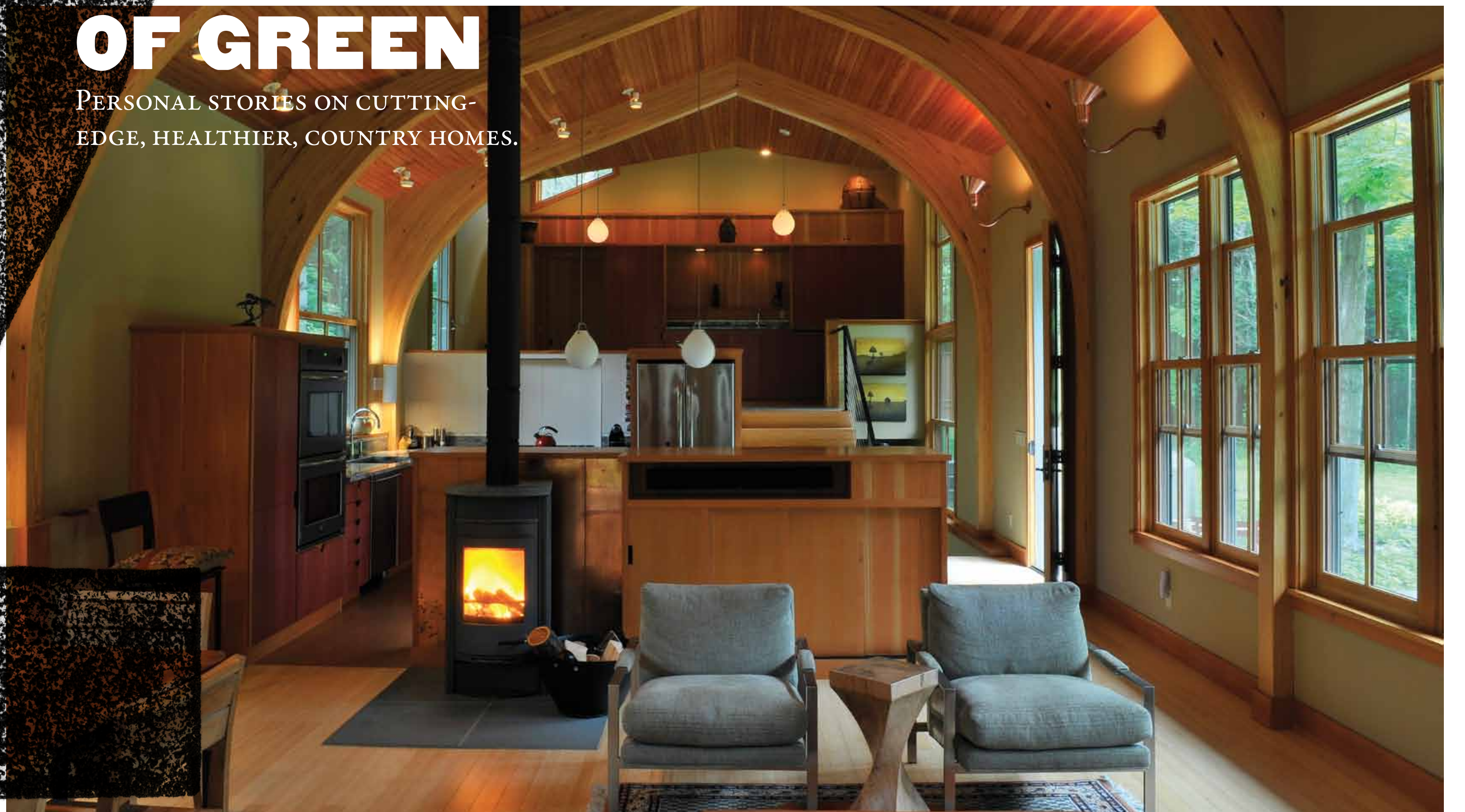
ABOVE | Spring River Residence, 3200 Square Feet

PERSONAL STORIES ON CUTTING-EDGE, HEALTHIER, COUNTRY HOMES.